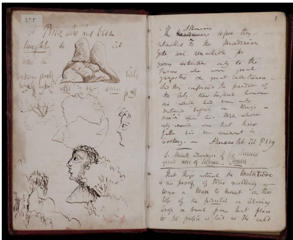
Image: Front endpaper and p.1 of Davy notebook RI MS HD/15/F (c. 1805), courtesy of the Royal Institution of Great Britain.