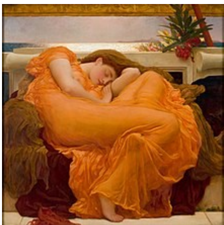
1895 "Flaming June" by Lord Leighton

June is named after the Roman Goddess Juno , goddess of marriage, and wife of the supreme deity Jupiter